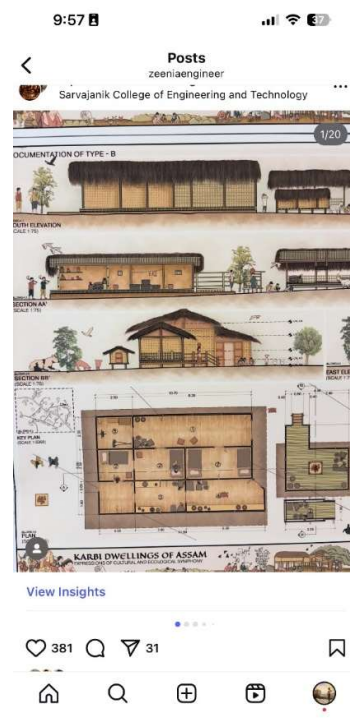
Figure 2: Presenting the academic works