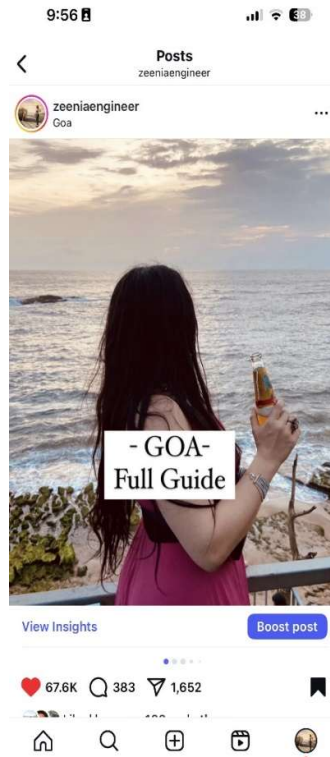
Figure 3: Presenting the city for tourists

In parallel with architectural and institutional interventions proposed for the rejuvenation of Parsi identity at Udwada, digital media emerges as a critical contemporary tool for cultural stewardship. Social media platforms enable the creation of a living, accessible, and participatory archive of Zoroastrian faith, rituals, cuisine, architecture, oral histories, and everyday community life. Through curated storytelling—reels, visual essays, food narratives, travel documentation, and intergenerational conversations—an Architect-Influencer can transform the proposed Zoroastrian Cultural and Architectural Centre at Udwada into a globally visible cultural anchor.